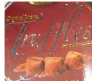
Chocolate Truffles $11