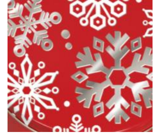
Light Fruit Cake $17