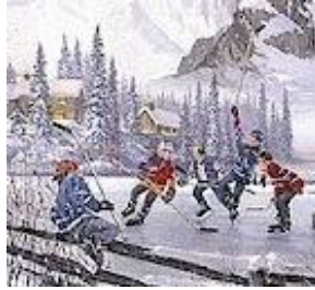
Dark Fruit Cake $17