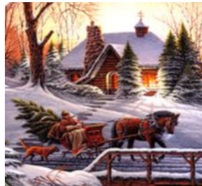
Cherry Pound Cake $17