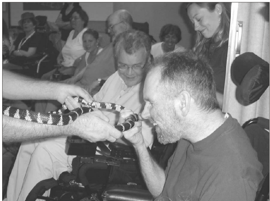
Members watching Ray's Reptiles presentation at the Ottawa Chapter

The SEP was another huge success again this year for both the students and the participants. We can't wait to see what next summer has in store!