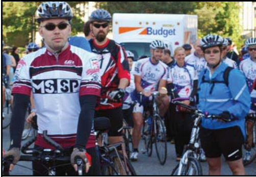
Cyclists ready to go! More pictures at flickr.com/MSOttawa

630 cyclists raised $450,000 for MS on a beautiful weekend in August. We couldn't have done it without our tireless volunteers and dedicated cyclists – Thank you!