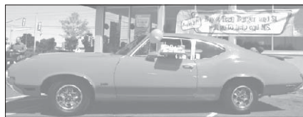
One of the classic cars from the 2009 Cruisin' for a Cause at the Merivale location.

On Thursday, August 26, visitors at 700 A&W restaurants across the country will support the MS Society of Canada as part of the second annual Cruisin' for a Cause. One dollar from every Teen Burger sold that day will be