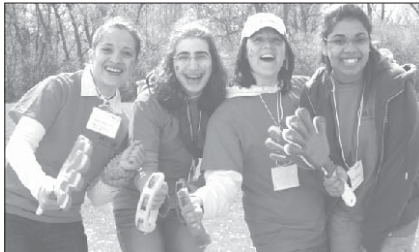
A few of our wonderful volunteers at the 2010 MS Walk!

We are looking for volunteers to help with the Bike Tour for pre-