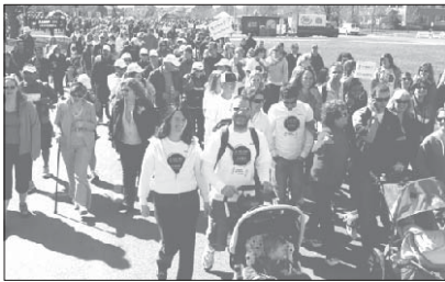
More than 1700 MS Walkers were out enjoying the sun on the Ottawa River parkway

Over 1700 people took part in the MS Walk in Ottawa, raising more than $365,000 in support of multiple sclerosis research, programs and services. The MS Walk is the Multiple Sclerosis Society of Canada's largest and most visible national fundraising activity, with walks taking place in over 160 communities across Canada.