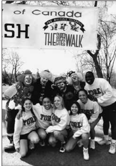
Just a few of the thousands of Super Cities WALK for MS participants who celebrated their success and contribution across the province this year.

A number of other events also contributed to this year’s fundraising success. Ontarians joined people all across the world in hosting an MS