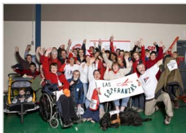
LAS ESPERANZAS, TROIS-RIVIÈRES