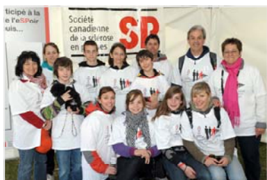
LES FRANFRELUCHES VIRILES, MONTREAL