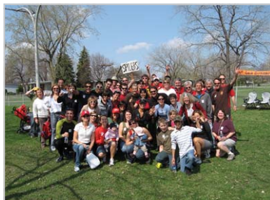
LES SPIDERS, LAVAL