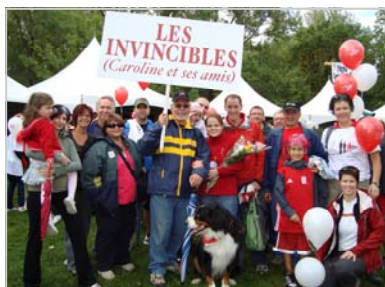
LES INVINCIBLES, QUEBEC