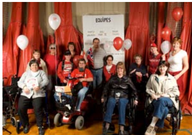
WEST ISLAND ROADRUNNERS— MONTREAL WEST ISLAND