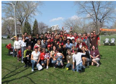
LES SPIDERS— LAVAL