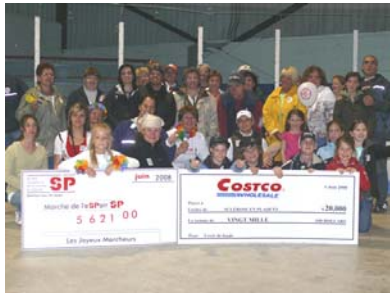
LES JOYEUX MARCHEURS— ALMA