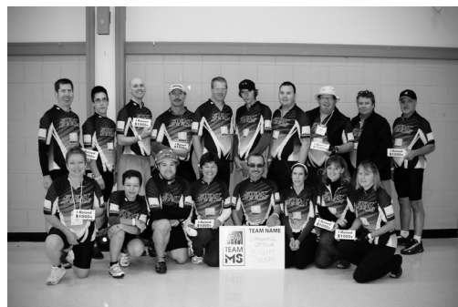
Cornwall Optical Sight Seers 2009 Top Fundraising Team—