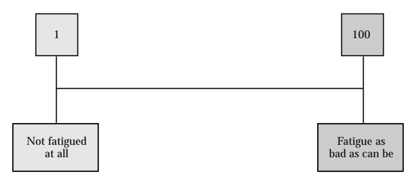
Table 3-2 The Fatigue Severity Scale

Figure 3-1. The Visual Analog Scale for Fatigue. In filling out this scale, you rate your fatigue on a scale of 1 (not fatigued at all) to 100 (fatigue as bad as can be).